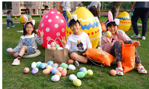
Children are having great play time. 小朋友玩得不亦樂乎。