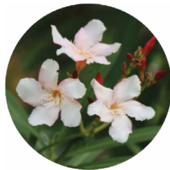
Common Oleander 夾竹桃