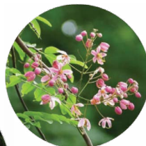
Pink Shower 爪哇決明