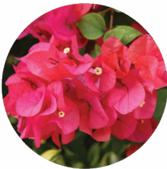
Brazil Bougainvillea 簕杜鵑