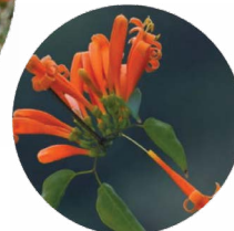
Fire-cracker Vine 炮仗花