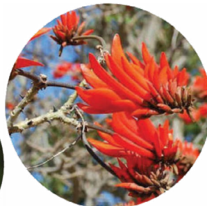
Coral Tree 刺桐