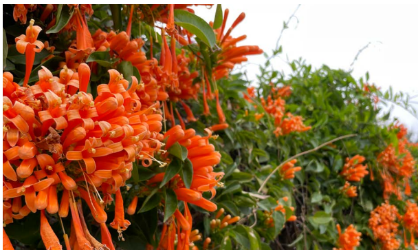
Gold Coast is full of blooming flowers. 黃金海岸花開處處。

Hashtags 標籤: #NatureLeisurePleasure #hkgoldcoastmoments #hkgoldcoastliving