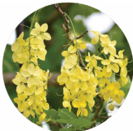
Golden Shower 豬腸豆