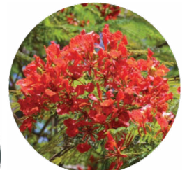
Flame Tree 鳳凰木