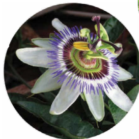
Passion Flower 西蕃蓮