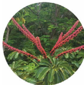
Umbrella Tree 傘樹