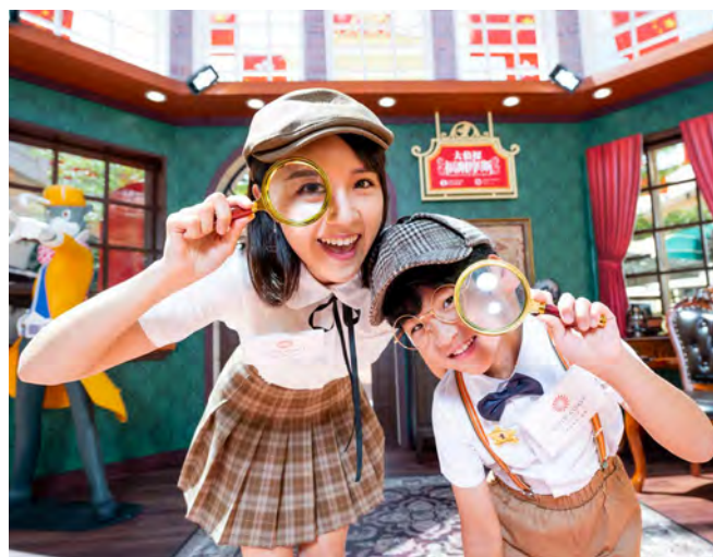
Photo Op 打卡場景2: Study Room 揭秘書房 📍 Courtyard, Gold Coast Piazza 商場中庭